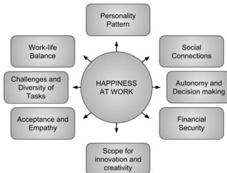
Figure 1 Happiness at work

Happy workplace means people development processes in organizations with goals and strategies in accordance with the vision of the organization to create the readiness for change and sustainable growth of the organization. There are 3 elements in the happy workplace as follows: 1) Happy People means employees are happy to work which will lead them to being a key personnel of the organization 2) Happy Home means the workplace which makes the employees feel that the workplace is the second home. It is the organization that has the creative coexistence and mutual development 3) Happy Teamwork means there is the cooperation between the community and the workplace to build the happy community (Wasontanarat and Wuttiwachaikaew, 2017). Chowdhury (2021) suggests happiness at work comprises personality, social connections, autonomy and decision making, financial security, scope for innovation and creativity, acceptance and empathy, challenges and diversity tasks, and work-life balance, as shown in Figure 1 as follows: