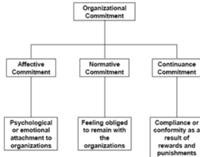
Figure 1 Meyer and Allen's three-component model of organizational commitment